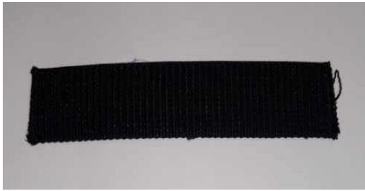
Military Belt (Black)