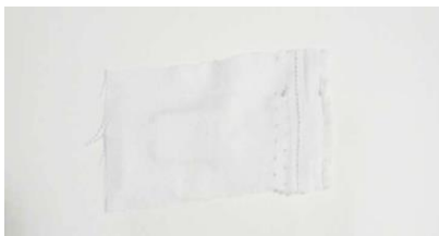
Peach Twill (White)