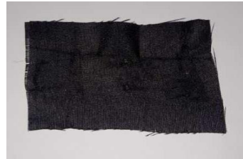
Pongee Alphagena (Black)