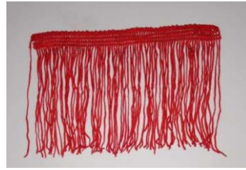
Tassels (White, Green, Red, Golden Yellow)