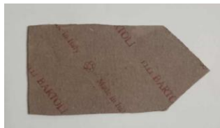
Insole Fiber Counter or Lethihan Board