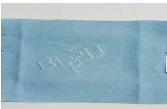
BIPSU Embroidered Cloth (Light Blue)