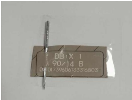
Needle DB x 1 size 90/14