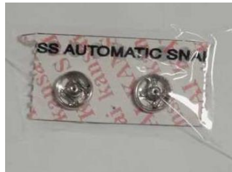
Snap Buttons Automatic