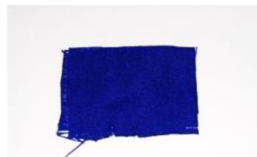
Katrina Cloth (Royal Blue)