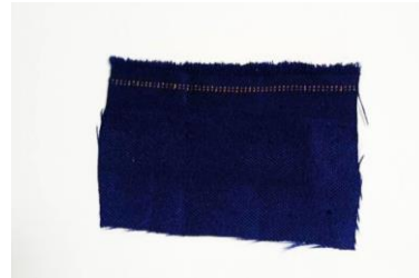
Peach Twill (Navy Blue)