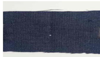
Fine Checkered Cloth