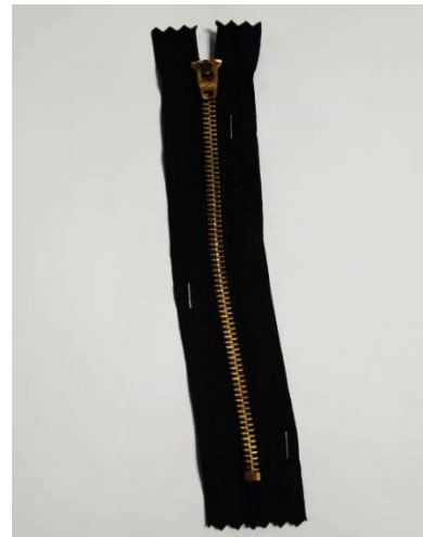
Metal Tooth Zipper