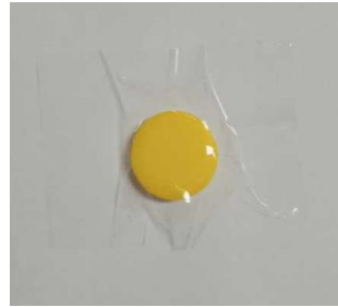
Nips Button (Egg Yellow)