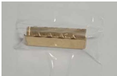
Gold Metal Belt Ends