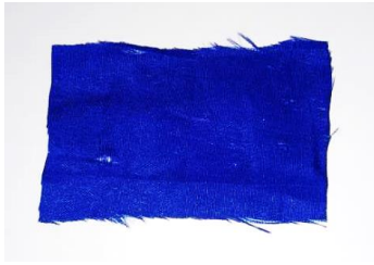
Pongee Alphagena (Royal Blue)