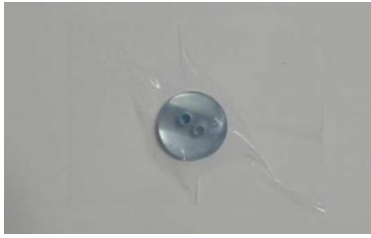
2 Holes Button (Light Blue)