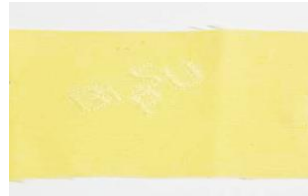
BIPSU Embroidered Cloth (Light Yellow)