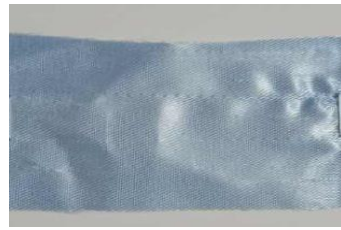
Crystal Silk (Powder Blue)