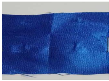
Crystal Silk Cloth (Royal Blue)