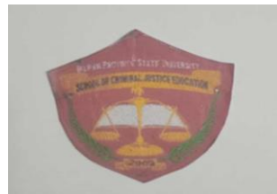
BIPSU Criminology Logo