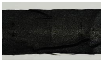
Crystal Silk Cloth (Black)