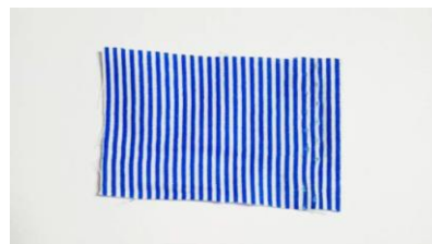
Opal Stripes (Blue & White)