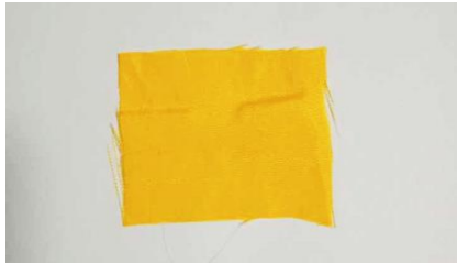
Pongee alphagena (Golden Yellow)