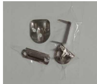
Hook and Eye (Male)