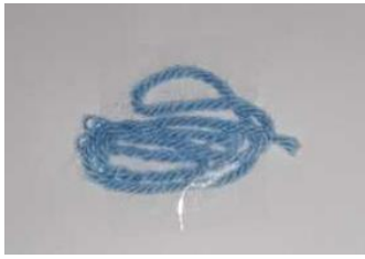
High Bulk Acrylic Knitting Yarn 4ply