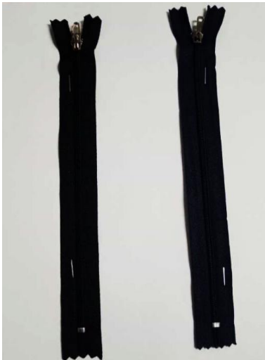
Nylon Tooth Zipper with Metal Head