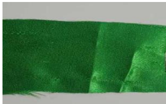
Crystal Silk (Green)