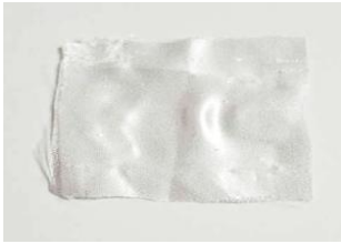
Crystal Silk (White)