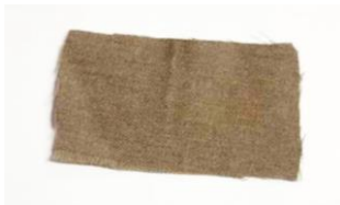
Wool Cloth or Fabric (Brown)