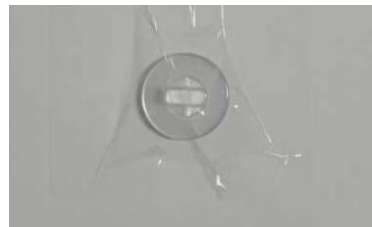
Shank Nips Button (White/ Bluish White)