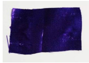
Crystal Silk (Violet)