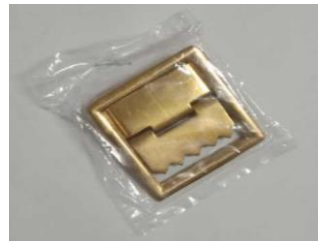
Skeletal Buckle (Gold Plated)