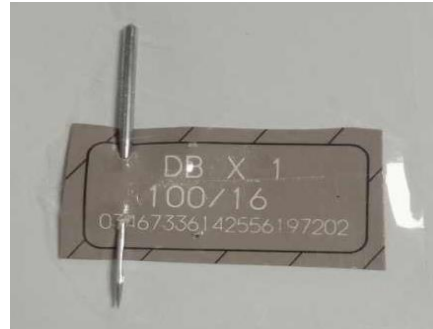
Needle DB x1 size 100/16