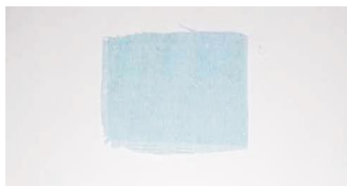
Katrina Cloth (Powder Blue)