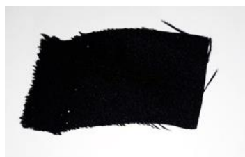
Gabardine Cloth (black)