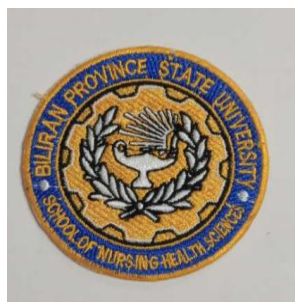
BIPSU Nursing Logo