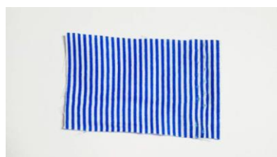
Opal Stripes (Blue & White)