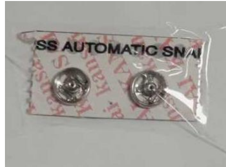
Snap Buttons Automatic