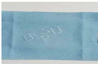
BIPSU Embroidered Cloth (Light Blue)