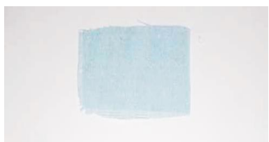
Katrina Cloth (Powder Blue)