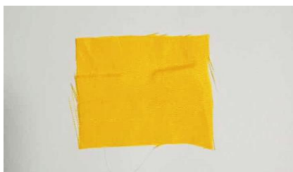
Pongee alphagena (Golden Yellow)