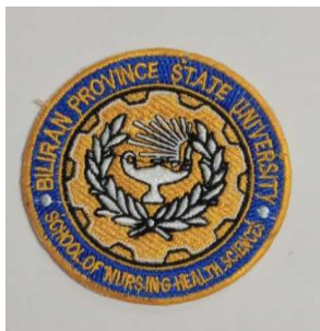
BIPSU Nursing Logo