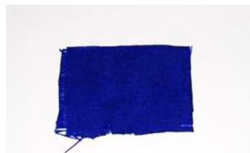
Katrina Cloth (Royal Blue)