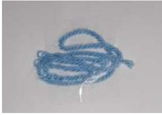
High Bulk Acrylic Knitting Yarn 4ply