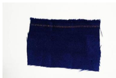
Peach Twill (Navy Blue)